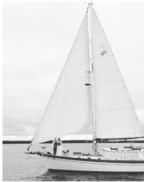
Top and left image: Colin Schye Right image: Kiah Brasch